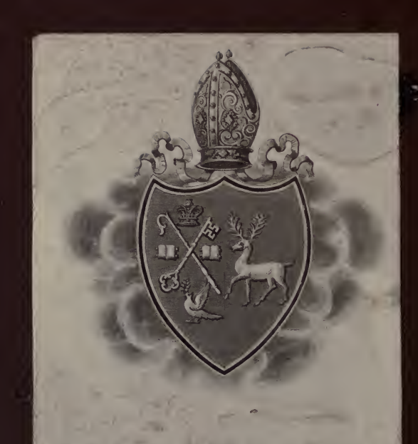
Collegii S.S. Trinitatis Apnd Torontonenses, Liber.